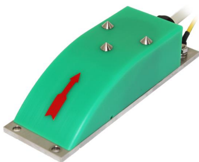
EMV-500™ SIZE B

The EMV-500™ is a water/wastewater electromagnetic velocity open channel flow meter sensor which is available in two sizes: